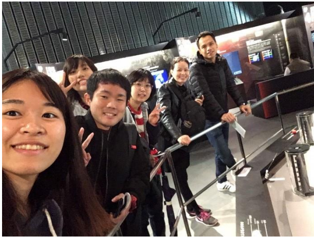
Visit to the science museum, MIRAI-KAN, on Nov. 24 with Tokyo NODAI students.