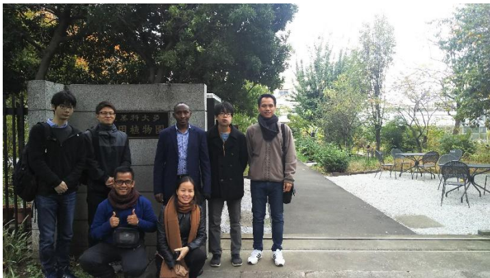
The visit to Medicinal botanical garden of Hoshi Pharmaceutical University on Nov. 24.