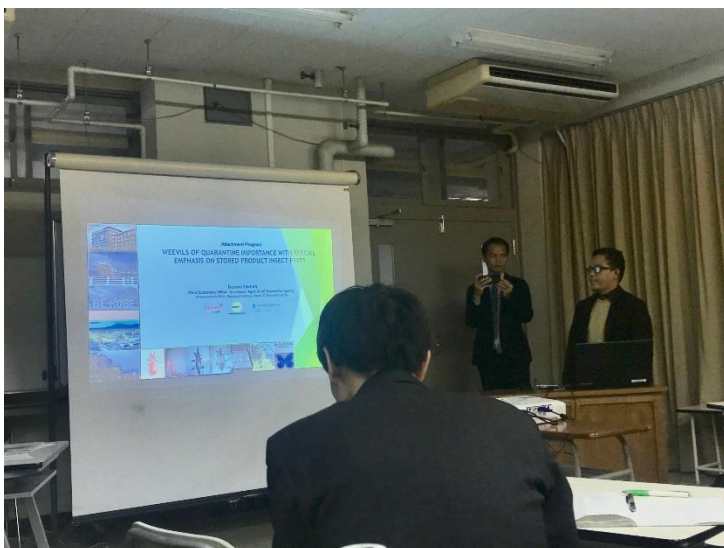
Final presentation by one of the trainees on Dec 17 at Tokyo NODAI